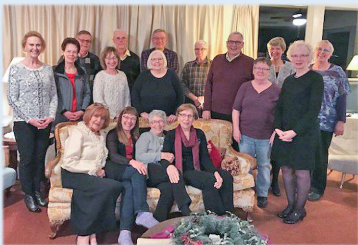
Faith Gathering, December 2019

Faith in God and love of family and friends was getting us through.