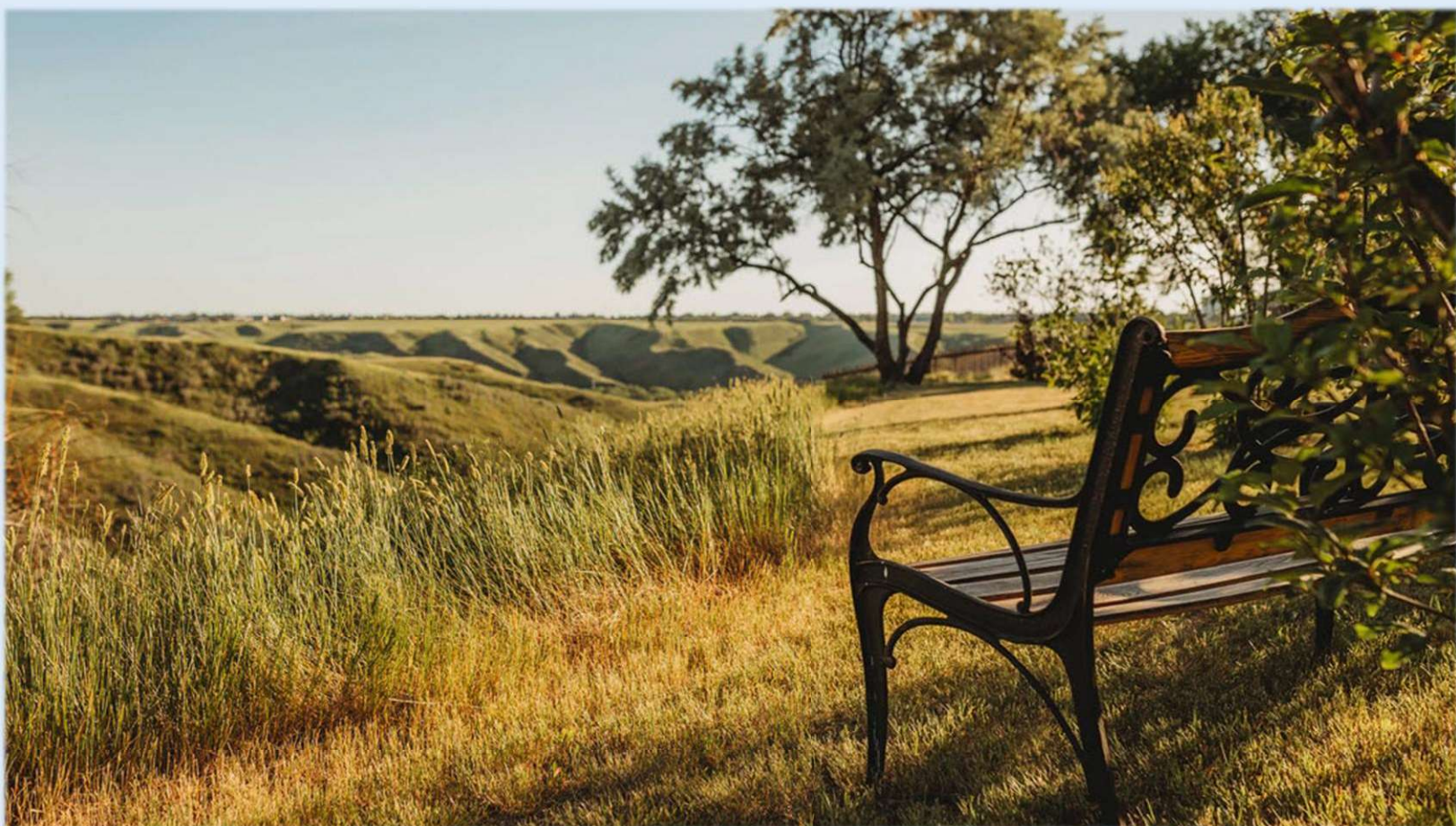
Photos of Martha Retreat Centre in Lethbridge, AB

Martha Associate (Lethbridge), Martha Retreat Centre Society Board Member & Secretary