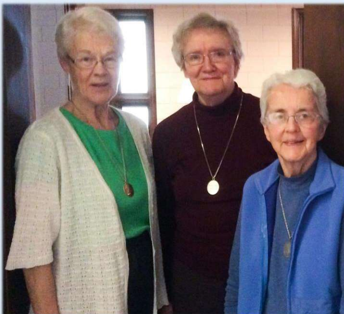
The last of the Marthas in Alberta.

We often speak of feeling the beating heart of the Marthas and continually witness how “prayed up” the Centre is!