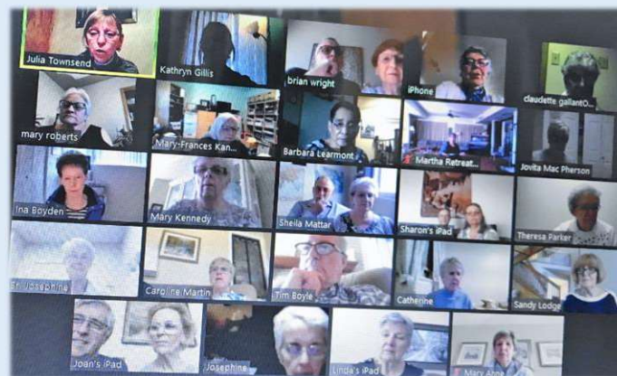
Zooming in 2021!