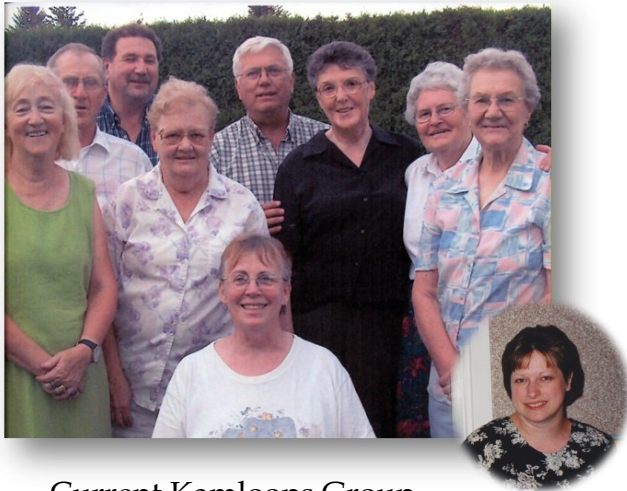
Current Kamloops Group