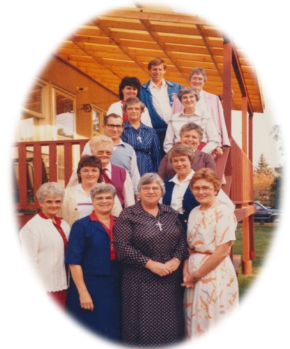
Original Kamloops Group