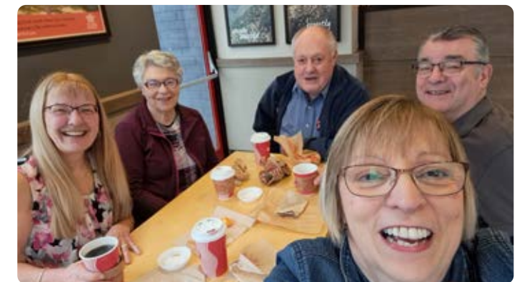
Associate gang April 2024