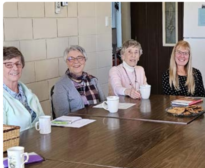
Visit with FCJ's - November 11th, 2023