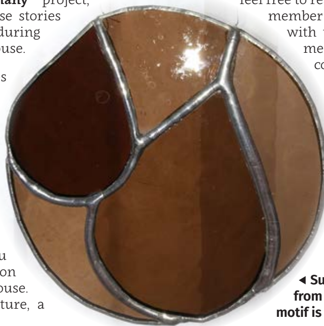
◀ Suncatcher made with stained glass from Bethany Chapel. The teardrop motif is based on Revelation 21:4

Our goal is to gather these stories and photographs for an exhibit celebrating the Congregation's 125th anniversary in 2025. We aim to collect narratives and images of 125 objects from Bethany, capturing the essence of the Sisters of St. Martha through the eyes of the people whose lives they touched. We invite you to share the story of any object you obtained from the deconstruction of the Bethany Motherhouse. Whether it's a piece of furniture, a