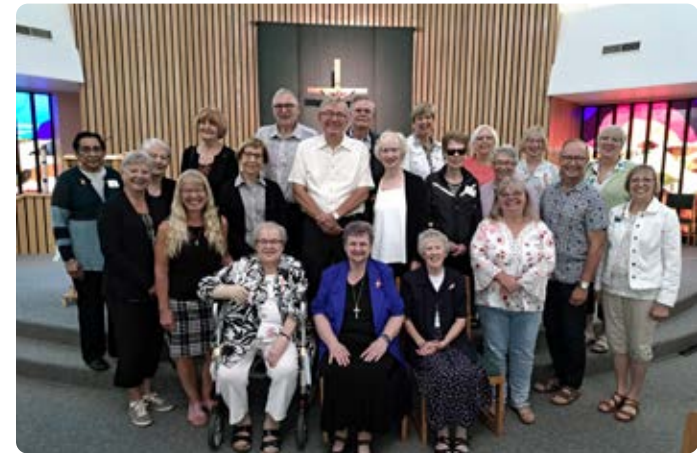
Lethbridge Associates and Sisters, September 2023

Hello from all of us Lethbridge Associates! How quickly the time passes, and here we are again at the end of another year's faith journey. As always, each of our gatherings this past year presented us with opportunities to learn, reflect, pray and consider the ways we are being challenged to live out and share "Gospel Hospitality" in the unique way each of us is called to do so.