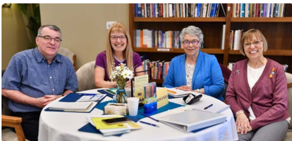
Martha Associates at Chapter ~ April 2024.

How many times have you heard someone say: “It has been such a busy year?” I am betting you could not count the number of times; everyone always seems to be SO busy!!! And yet, I find myself in that exact spot, so please forgive the cliché and allow me to share some of this “busy” year with you!