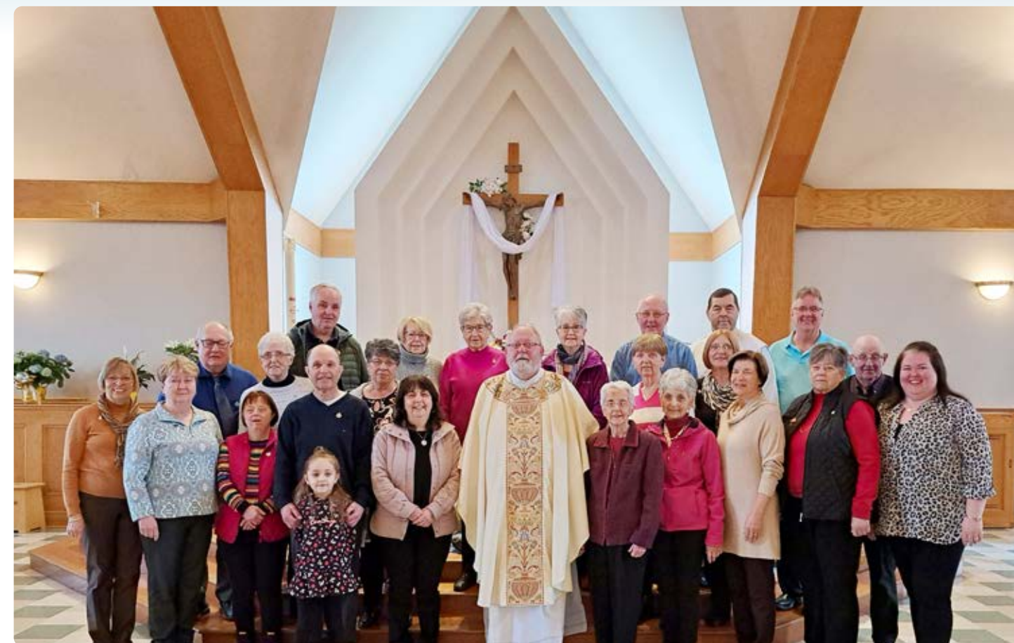
Mass For Shut Ins. April 6, 2024.