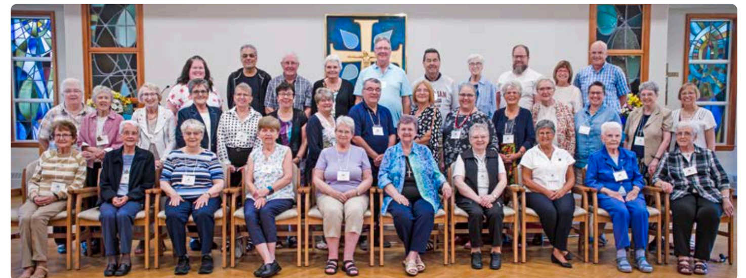
Eastern Retreat ~ September 7, 2024.