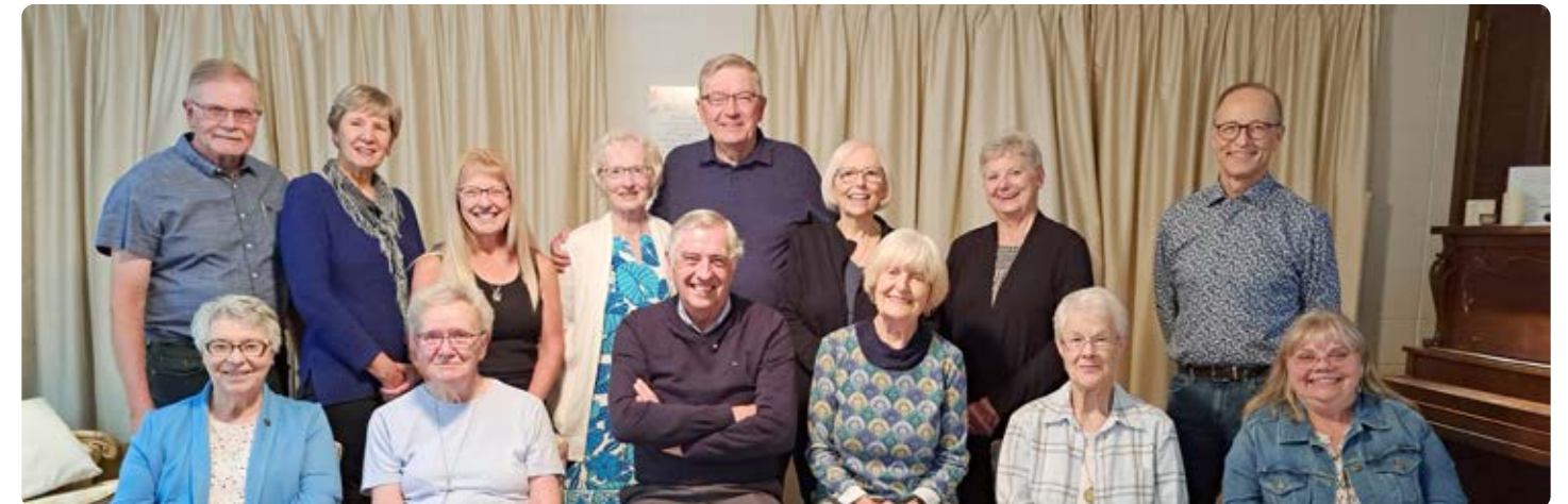
Western Retreat ~ September 13, 2024.