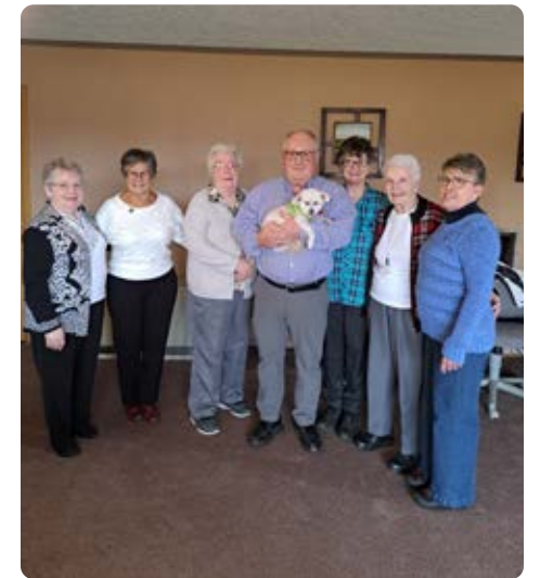
Trenton Martha Associates 2024